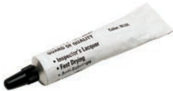
Item Part Number: 90319GT