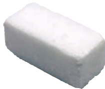
Item Part Number: 90337GT

Benefit – Fast Drying Lacquer. Shows if parts or fittings have come loose or have moved. Helps prevent unauthorized tampering. Highly visible. Excellent Adhesion to metals. Easy application squeeze tube.