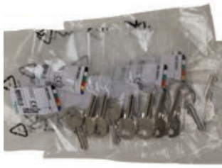
Item Part Number: 37947GT