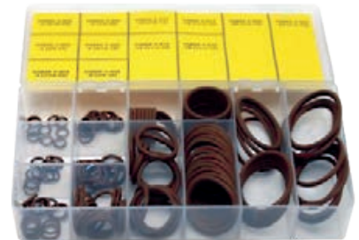
Item Part Number: 58565GT

Model: Used primarily on aluminum products to lubricate columns.