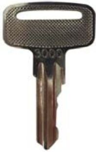
Item Part Number: 21982GT